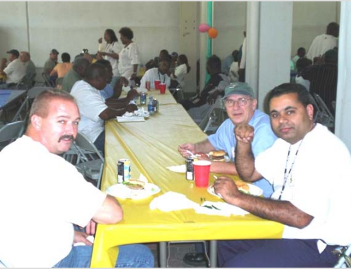
Area 3 team