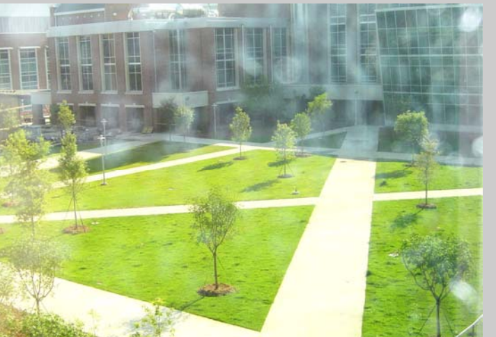
The courtyard between BME, IBB, EST, and M buildings has been landscaped in preparation for the opening of the M building.