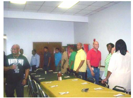
Father's Day celebrations at Building Services

On June 16 th , the ladies of Zone 1 and 2 hosted a Fathers' Day Luncheon for the men in there respective zones. The men were served steaks, baked potatoes, corn on the cob, salad, beans, rolls and dessert. As you can see from there happy faces the LADIES really did it up. This is an annual occurrence and the men of these zones do like wise for the ladies in the zones.