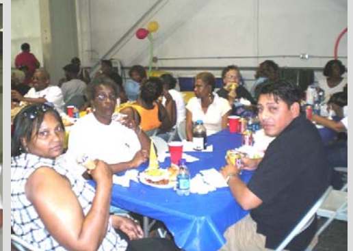
Building Services staff