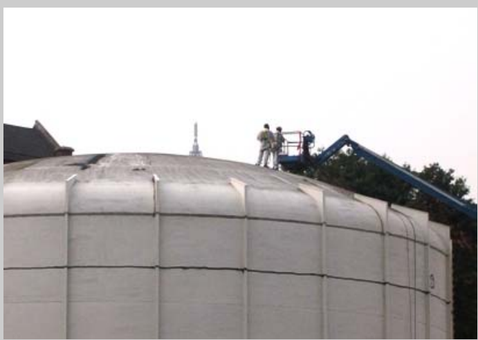
Electronic Research Building is being demolished to make room for the Nano-Technology Center.