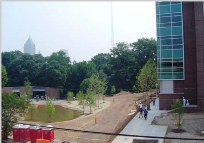
The Molecular Science and Technology building is receiving its final touches. It will be ready in October 2006.