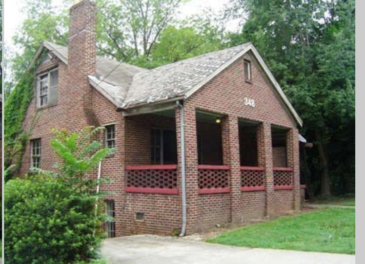
The house at 328 10th street is scheduled for demolishing to make room for our next large building.