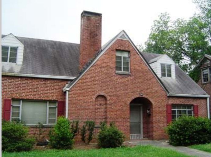
The house at 318 10th street is scheduled for demolishing to make room for our next large building.