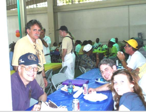
Design and Construction