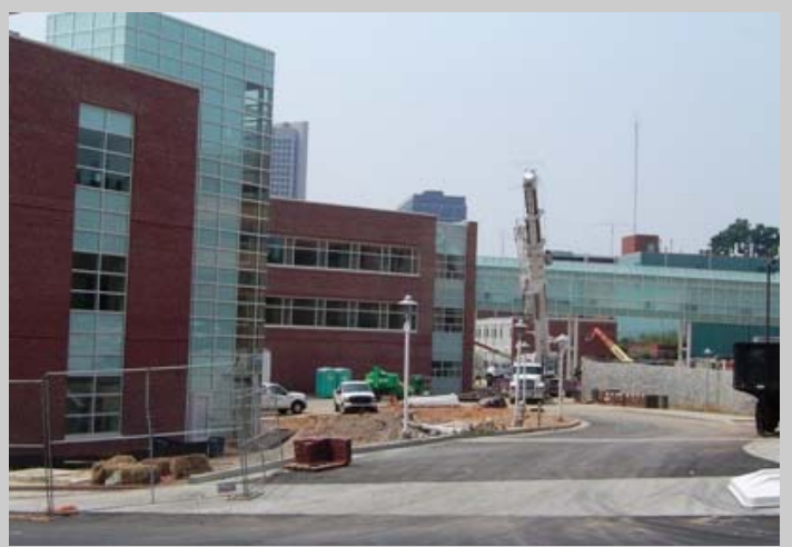
Klaus Computing Center and Parking Deck are getting the final touches. They are scheduled to open in Dec