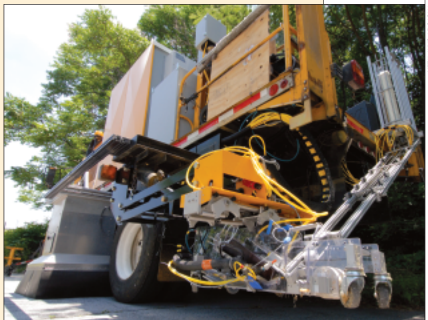
BELOW: On an automated system that places reflective raised pavement markers (RPM), a lane-stripe pattern-change mechanism is mounted on a lift mechanism and carriage.