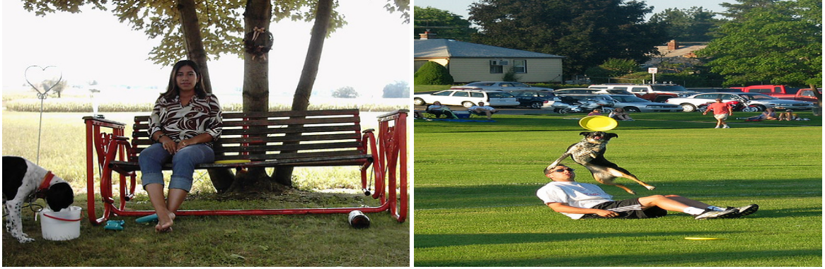
Figure 1.1: Example images from COCO Attributes. These are sample images from the dataset with the labels underneath listing the objects as identified in the dataset. Each object is labeled with a set of attributes e.g. the dog has the attributes “standing”, “hairy”, “fluffy”, “soft” and “tame” for (a). Similarly for (b), the person is labeled “adult” and a car in the background is labeled with “metal / metallic” and “parked”.

such, along with transfer learning, are the dominant paradigm for training deep networks. In this vein, Abdalnabi et al. [20] train multiple CNNs, one for each attribute, whose output is fed into a shared linear layer that learns to aggregate the representations in order to provide accurate attribute recognition for clothes. However, this formulation is very resource heavy, especially for large scale attribute recognition where the number of attributes can easily be above 100. As an improvement, Hand and Chellappa [21] proposed using a single CNN backbone network to extract visual features and then split the network into multiple heads, one for each attribute group such that each head can predict an attribute, with an extra linear layer at the end to learn attribute dependencies. While this method focuses only on faces and does not leverage any type of transfer learning, this formulation has the adverse effect of requiring the model be retrained on the entire dataset each time a new attribute is added. In contrast, while our model is partly inspired by this model, our model has the advantage of being much more efficient and lightweight, and easily extensible to any number of attributes, while only requiring the new modules be trained on the relevant subset of data.