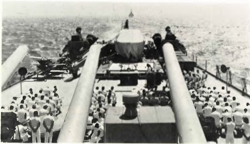
Chapel services on deck serve to promote the spiritual lives of the men.

Life aboard a training ship has many varied and interesting phases.