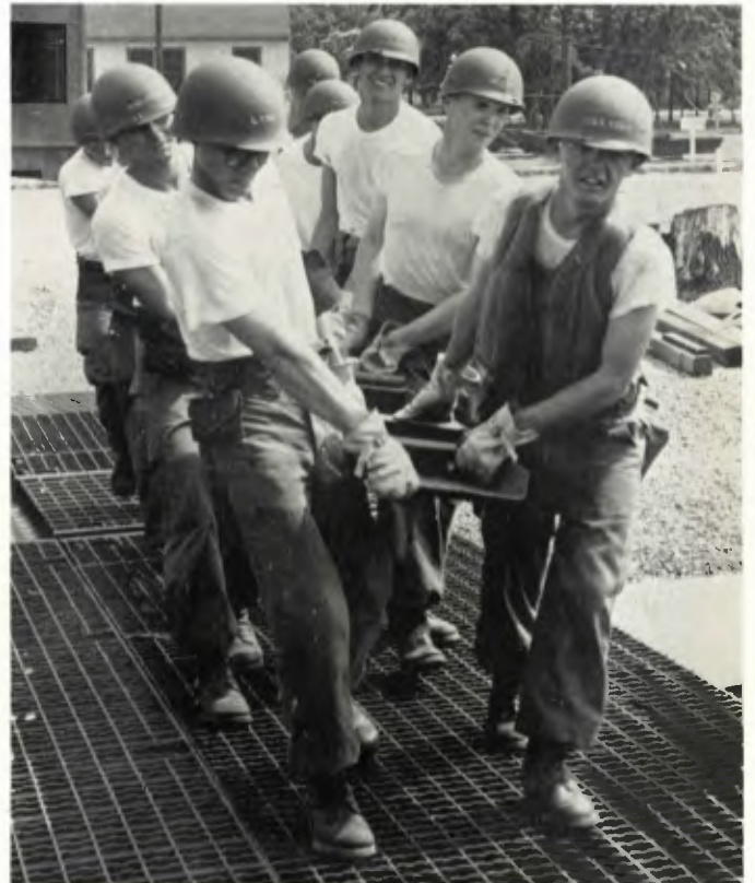
The Engineers learn by actually carrying out the maneuvers.