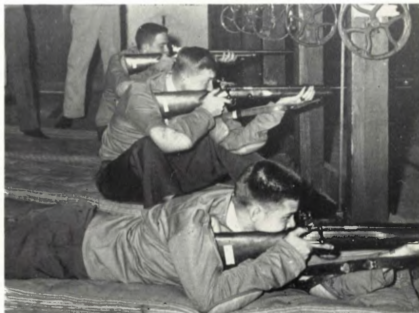
Cadets have top marksmanship whether in the air or on the ground.