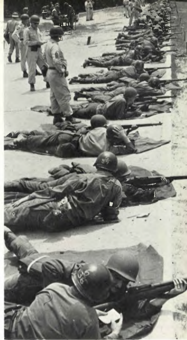
Cadets zero in their M-1 rifles at Tracy Range, Ft. Belvoir, Va. during ROTC summer training camp.

couldn't hit the targets? . . . "I'd sure like to get my hands on the guy who invented those obstacle courses!" . . . Remember how we used to get up in the middle of the night (it seemed). Seems like they could find a different eight hours in which to do a day's work. . . . How about the night all the guys slept on the floor so they wouldn't mess up their bunks for the inspection next morning? . . . Remember the "milkshake" party the last night? . . . However, when the "hurry up and wait" days were gone it seemed as if they began only the day before. . . .