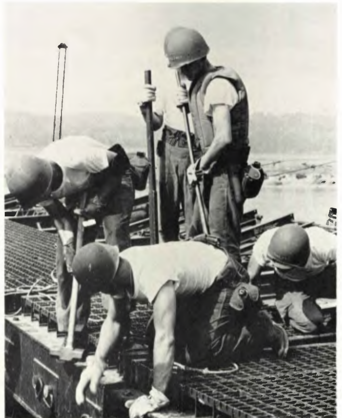
Much practical experience is gained at the summer camp.

"Awright you guys, fall in on the double!" . . . It was these charming words that began six weeks of military life and procedure. . . . The uniform line was filled with remarks about the poor taste in color and someone even asked what happened to the belt buckles on the backs of the pants. . . . Of course there were the more enjoyable moments such as marching through the rain on bivouac. . . . Remember that inspecting officer in the barracks? Boy, I'll bet his wife catches it! . . . Those days on the rifle range weren't too bad except that we