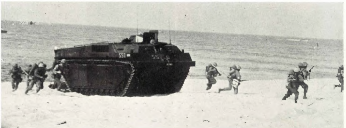
The midshipmen are indoctrinated into many phases of the Navy's varied training program through active participation.