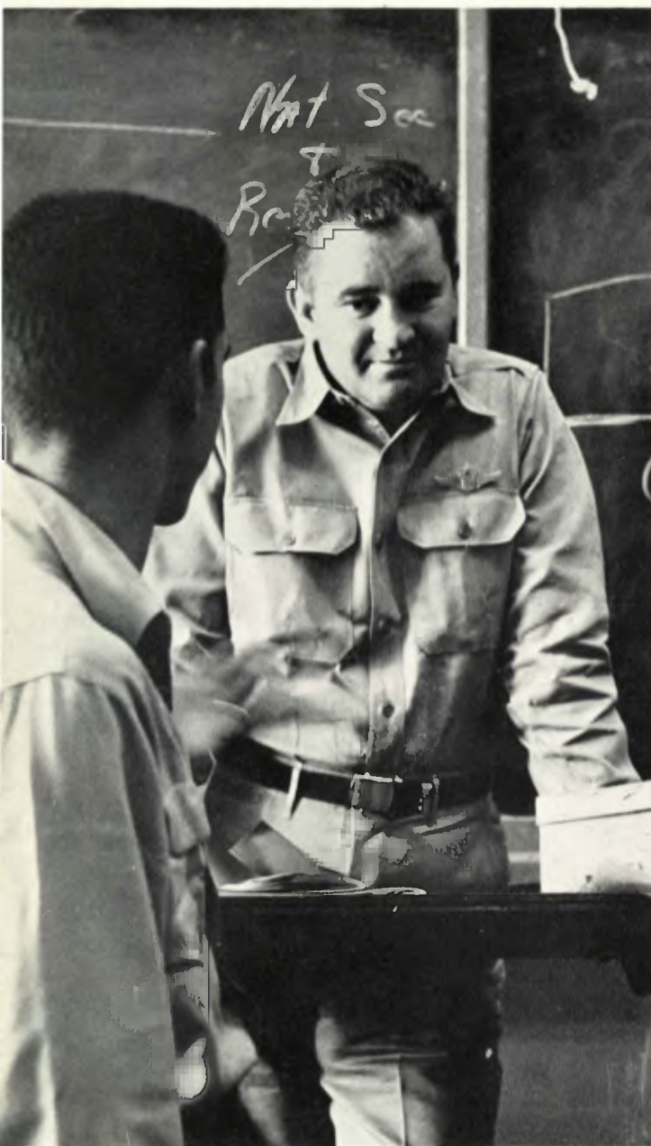
Instructors are instrumental in the forming of good officers.