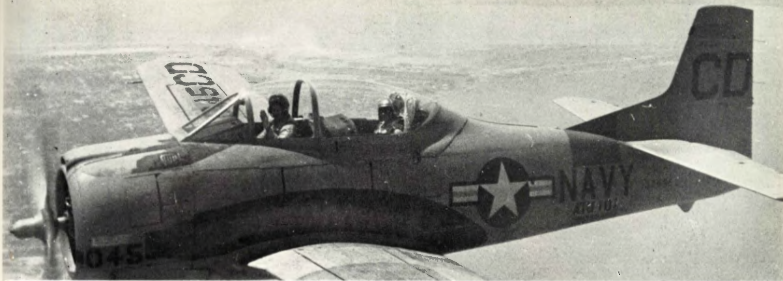
A regular Navy student receives practical experiences in flight training while on summer cruise at Corpus Christi, Texas.

flashlight in his face while looking for the mid-watch relief and, of course, the Bos'un on the IMC who constantly shouted, "Now all midshipmen who have not done so, do so immediately!" or "Hereafter, there will be no — be no — be no — !" . . . But hitting port made all well again. London and its Piccadilly Circus and Paris and its Moulin Rouge! . . . Um boy! Of course, the fun was short-lived and soon the ship was on the high seas once more. . . . Two weeks more of the routine of watch standing, turning to, and long chow lines. . . . Guantanamo Bay, Cuba, was the next, and last, stop. . . . After gunnery practice in the Caribbean, the ship finally weighed anchor and nosed out of the bay and headed northward — homeward bound after a long and definitely educational eight weeks at sea!