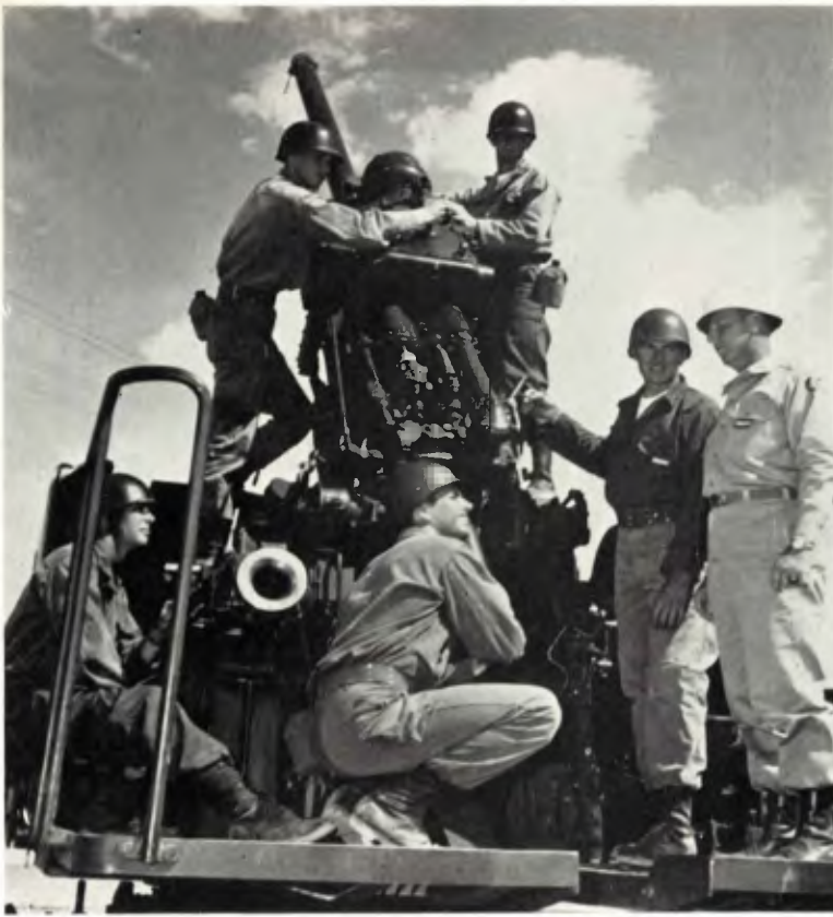
The training at the summer camps produces cadets ready to serve.

couldn't hit the targets? . . . "I'd sure like to get my hands on the guy who invented those obstacle courses!" . . . Remember how we used to get up in the middle of the night (it seemed). Seems like they could find a different eight hours in which to do a day's work. . . . How about the night all the guys slept on the floor so they wouldn't mess up their bunks for the inspection next morning? . . . Remember the "milkshake" party the last night? . . . However, when the "hurry up and wait" days were gone it seemed as if they began only the day before. . . .