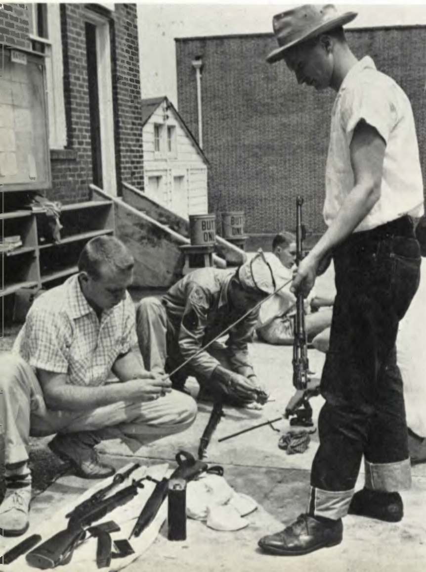
Army ROTC teaches the cadet a sense of responsibility for his weapon.

"Awright you guys, fall in on the double!" . . . It was these charming words that began six weeks of military life and procedure. . . . The uniform line was filled with remarks about the poor taste in color and someone even asked what happened to the belt buckles on the backs of the pants. . . . Of course there were the more enjoyable moments such as marching through the rain on bivouac. . . . Remember that inspecting officer in the barracks? Boy, I'll bet his wife catches it! . . . Those days on the rifle range weren't too bad except that we