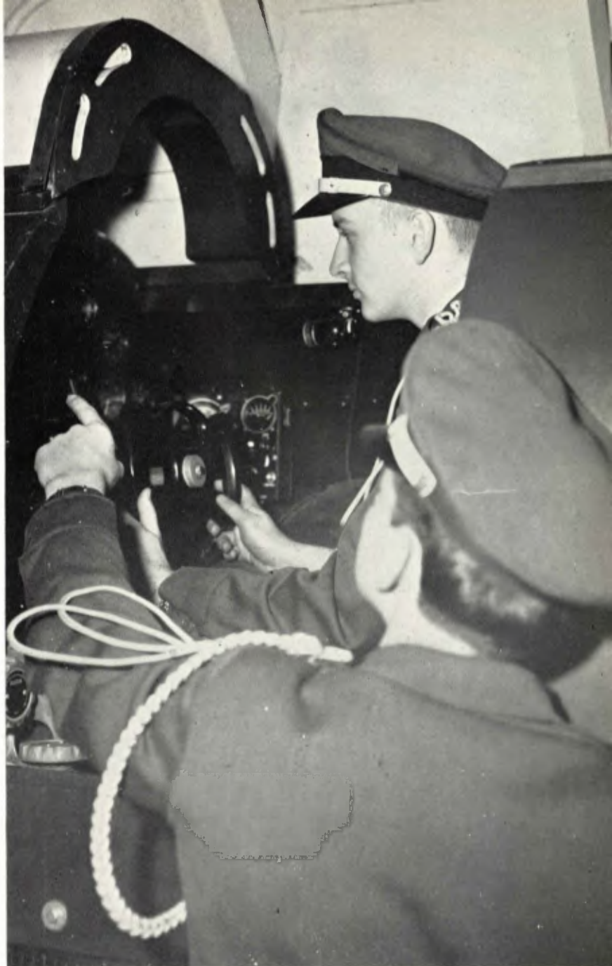
The Link Trainer is an invaluable training aid in learning to fly.

not fly, everywhere they went. . . . Perhaps the most enjoyable moments of the entire six were spent in the lecture hall—asleep on the floor! . . . Who will ever forget the gas attack and the time the cadet OD was grabbed and mauled during bed check. . . . Those T-33's looked like iron monsters at first but after an hour up the cadets landed and walked and talked like thousand-hour men. . . . That evening the Officers Club was filled with tales of these new veterans. . . . Of course, on the last night the tactical officers were dumped in the swimming pool! . . . Passing through the main gates for the last time brought sudden realization that it was all over and then also came the realization that it wasn't so bad after all. . . .