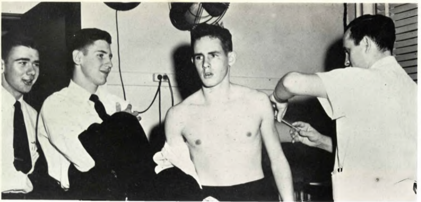
One of the initial and painful preparations for summer cruise is the physical and the endless line of vaccinations and shots.