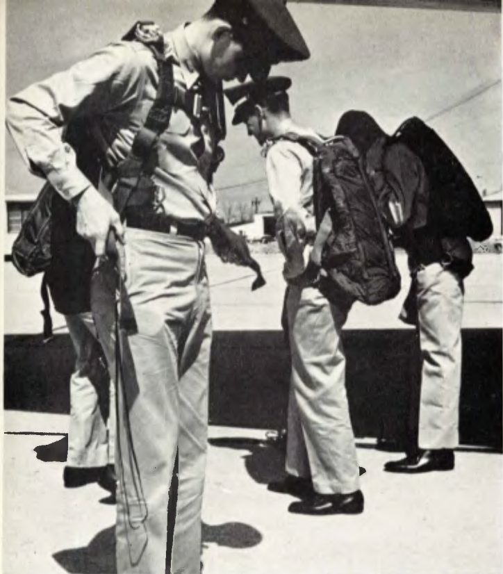
The actual flight is the all-important moment for the cadet.

not fly, everywhere they went. . . . Perhaps the most enjoyable moments of the entire six were spent in the lecture hall—asleep on the floor! . . . Who will ever forget the gas attack and the time the cadet OD was grabbed and mauled during bed check. . . . Those T-33's looked like iron monsters at first but after an hour up the cadets landed and walked and talked like thousand-hour men. . . . That evening the Officers Club was filled with tales of these new veterans. . . . Of course, on the last night the tactical officers were dumped in the swimming pool! . . . Passing through the main gates for the last time brought sudden realization that it was all over and then also came the realization that it wasn't so bad after all. . . .