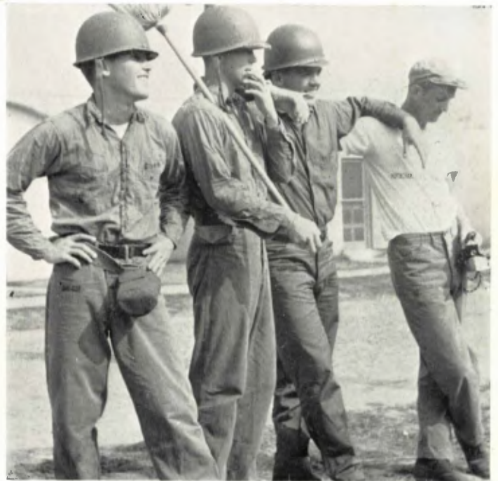
The Supply Corp offers many opportunities for service.

flashlight in his face while looking for the mid-watch relief and, of course, the Bos'un on the IMC who constantly shouted, "Now all midshipmen who have not done so, do so immediately!" or "Hereafter, there will be no — be no — be no — !" . . . But hitting port made all well again. London and its Piccadilly Circus and Paris and its Moulin Rouge! . . . Um boy! Of course, the fun was short-lived and soon the ship was on the high seas once more. . . . Two weeks more of the routine of watch standing, turning to, and long chow lines. . . . Guantanamo Bay, Cuba, was the next, and last, stop. . . . After gunnery practice in the Caribbean, the ship finally weighed anchor and nosed out of the bay and headed northward — homeward bound after a long and definitely educational eight weeks at sea!