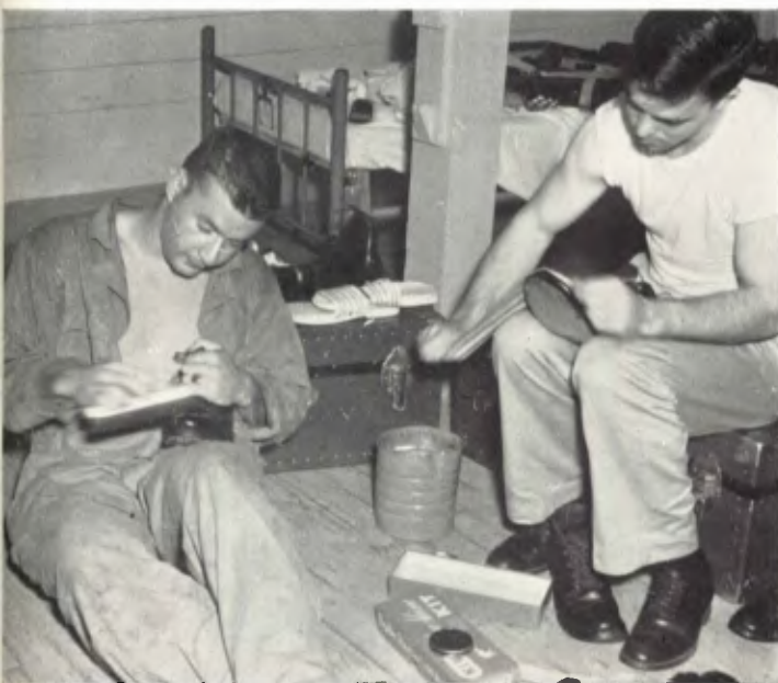
Neatness is a byword of the cadets at summer camp.