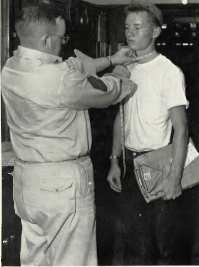
The uniform brings a cadet to the realization that he is now an actual part of the army ROTC training program.