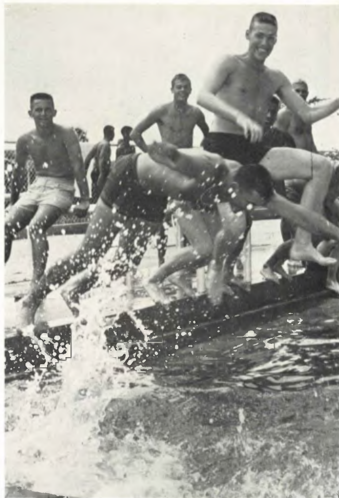
Summer camp also offers the cadets an opportunity to relax.

Nothing could have been more frightening than going through the Base gates and reporting to the cadet office for the first time. . . . To insure maximum enjoyment for everyone, morning inspections began immediately and the usual spit and polish brilliance and measured 45 degree corners on the beds seldom met with complete approval. . . . No one ever figured out why a bunch of air force cadets had to march, and