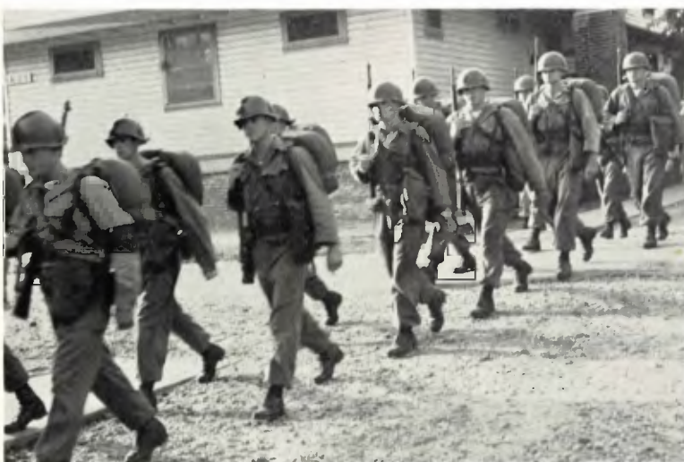
The hike to the nights bivouac area is an unforgettable experience.