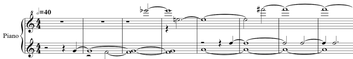
Fig. 2: An excerpt from the score generated for solo pianist; note the long durations and sparse texture.

This means that, unlike Case Study #1, there are no audible trends over time. Similarly, there cannot be a presentation of the data using ‘soundlike’ MIDI, as there is no real-world sound associated with the data. Indeed, it could be said that loneliness is associated with an absence of sound. This is where considerations as a composer must come to the fore - how can a piece based on loneliness data achieve a clear aesthetic, when there is no way that the audience could notice trends in the data, due to the way that they have been collected and collated?