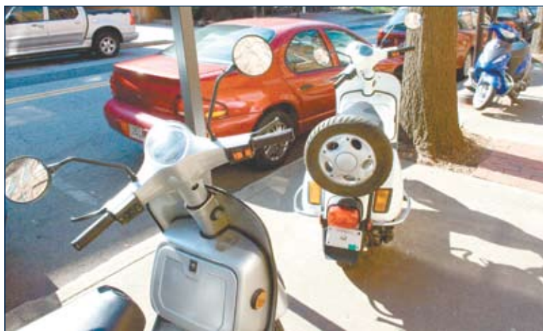
The Office of Parking and Transportation requests that drivers of scooters, mopeds and motorbikes register their vehicles and park in lots specified for motorcycles.

“It’s really an issue of campus safety for all,” Lunsway said. “Pedestrians, bikers and vehicles all must work together to create a safe campus environment.”