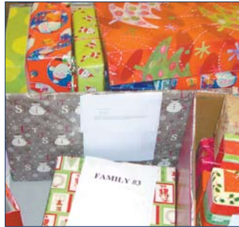
Photographs submitted to The Whistle

For others wanting to provide the same kind of aid, Kirk says it's not that difficult. The Lyman Hall community approached supervisors in Auxiliary Services and Facilities to locate some families to help during the holidays. To ensure that most of