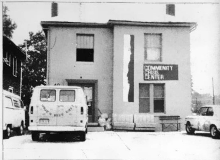
SERVICES OFFERED by Community Crisis Center. See story on page 3.