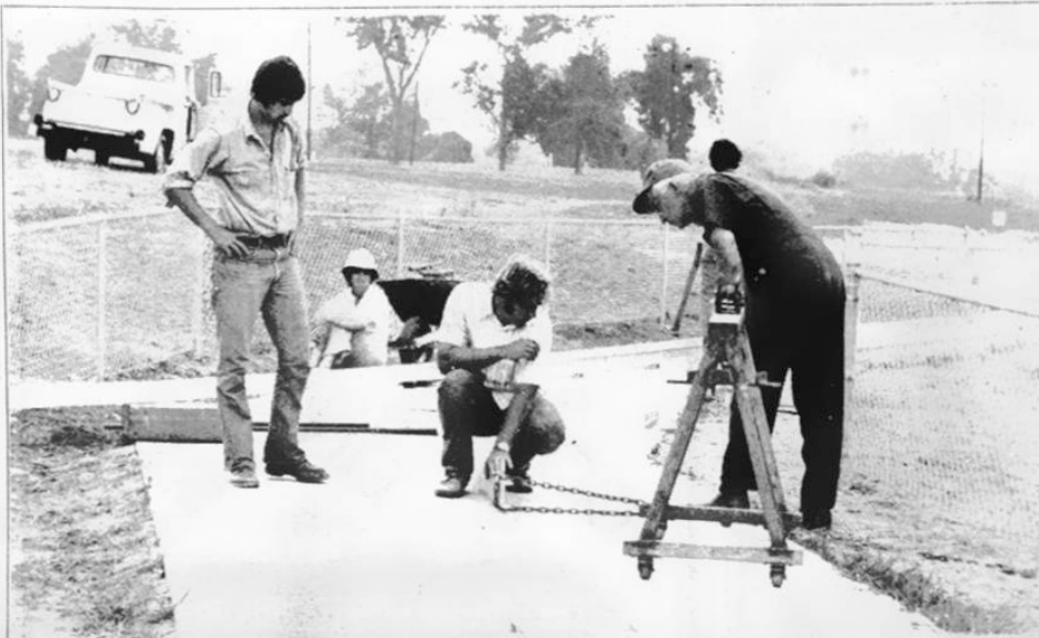
THESE DILIGENT WORKERS are working on the long-awaited Transette system. Soon Area III residents will ride in comfort to classes.

In addition to SAC construction, the land behind Couch School in Area III is being stripped and leveled. Also, grading, plowing and seeding are continuing along the Ferst Drive extension and the Northside Drive bridge and interchange.