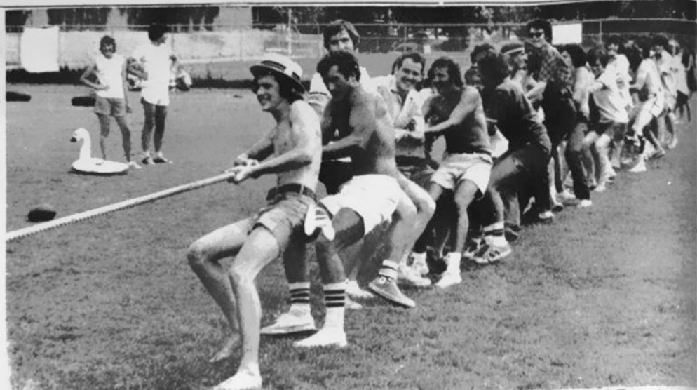
UPPERCLASSMEN slaughtered the rats in a Tug-of-War on Field Day.