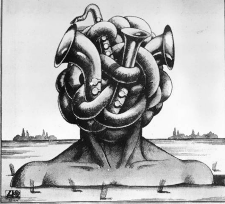
The Case of the 3 Sided Dream in Audio Color/Rahsaan Roland Kirk