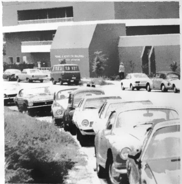
NEW STUDENT TRAFFIC APPEALS BOARD procedures may come as a surprise to parking violators. Read the story at left for details.

The student is then notified by the Secretary of the Appeals board when his appeal will be considered.