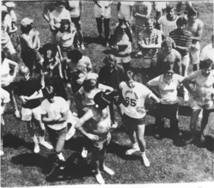
NO WHOPPER coupons and only eight pages?