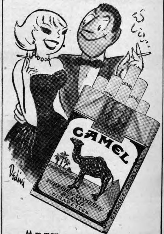
M-m-man, that's PURE PLEASURE!

For more pure pleasure... SMOKE CAMELS! No other cigarette is so rich-tasting, yet so mild!