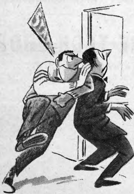
When a roommate gets you a blind date with his younger sister . . .