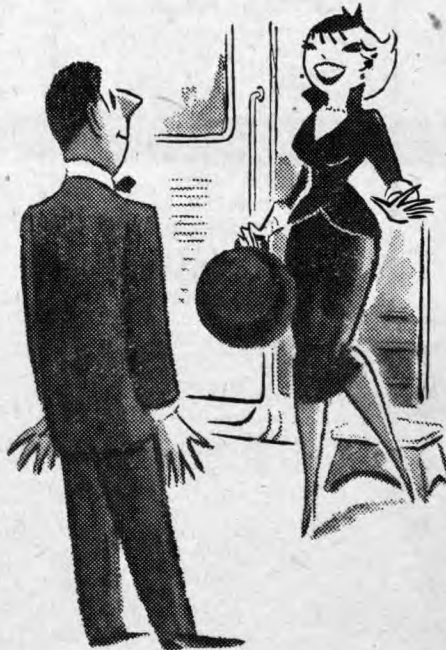
and she turns out to be a real doll . . .