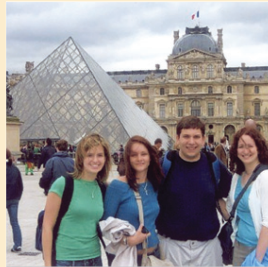
Approximately 45 percent of Georgia Tech students graduate with an international experience (study, work, and/or research abroad).

their Georgia Tech diplomas, made possible because of a goal to make a Georgia Tech education within reach of every qualified Georgia resident, regardless of family income. Their Georgia Tech education will have a real and lasting impact not only on their lives, but also for generations to come. There is a parallel here to Georgia Tech as an Institute. The impact is broad, far-reaching, and lasting. While this annual spring update provides highlights, there are many other significant accomplishments through teaching, research, entrepreneurship, and collaborations by the Georgia Tech community that together are helping to define the technological research university of the 21st century.