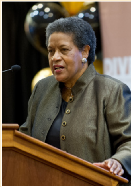
Civil rights leader Myrlie Evers-Williams spoke at an event on campus during the Martin Luther King Jr. week of celebration.

Our annual InVenture Prize competition gives students experience in innovation, working as a team, designing a business plan, and communication before a live television audience. This year's winner was "Re-Hand," a software-assisted home-use hand assessment and rehabilitation device. The winning team received a cash prize of $15,000, a free U.S. patent filing by Georgia Tech's Office of Technology Licensing, and automatic acceptance to the 2012 class of Flashpoint.