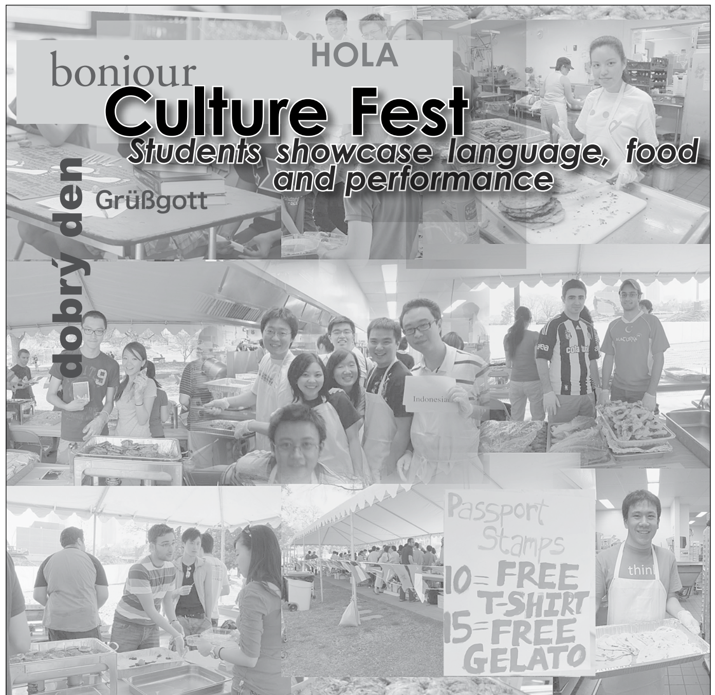
Illustration by Kelvin Kuo

Reality Unveiled featured exhibits in North Ave. on taboo political topics.