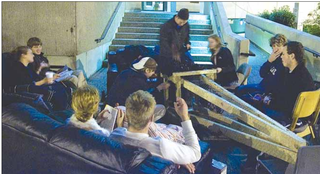
By Ariel Bravy / STUDENT PUBLICATIONS

Students camp out in tents in front of the ticket office before game day. Now the Athletic Association has hired an outside group to manage ticket sales while students can use an online system to reserve their tickets during game week.