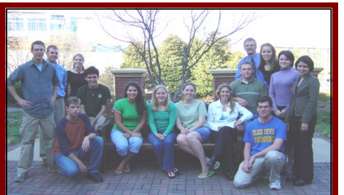
Members of the Ivan Allen College Student Advisory Board. For more information about the board, its activities and how you can get involved, visit our website at www.iac.gatech.edu/sab .

Help us make the IAC a better place. We should always continue to grow and reach for new heights. Get involved. Make a difference.