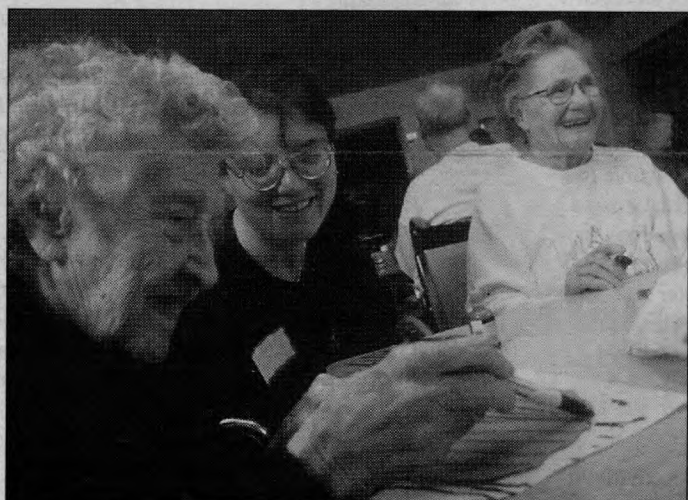
A person's memory can decline by as much as 40 percent between the ages of 25 and 65.

"A younger adult might remember the location without even consciously attending to it. Older adults often won't, so they