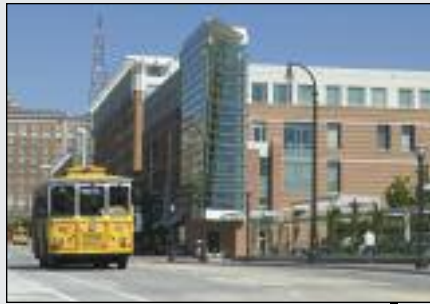
2003: Construction of Tech Square is complete (left); Georgia Tech-Savannah begins holding classes; and the R. Kirk Landon Learning Center childcare facility—for Tech and the Home Park neighborhood—opens.