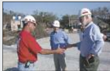
2008: Construction is scheduled to be complete in October for the Marcus Nanotechnology Building, which will house the largest clean room facility in the Southeast.