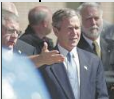
2002: The Russ Chandler Baseball Stadium renovations are completed; President George W. Bush visits the Institute to see a technology demonstration for first-responders in the war against terrorism.