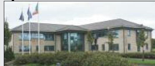
2006: A picture of collaboration and green engineering, the Klaus Advanced Computing Building (above) houses College of Engineering and College of Computing classes, as well as several innovations that support environmental sustainability; Georgia Tech-Ireland (top), a division of the Georgia Tech Research Institute, opens in Athlone.