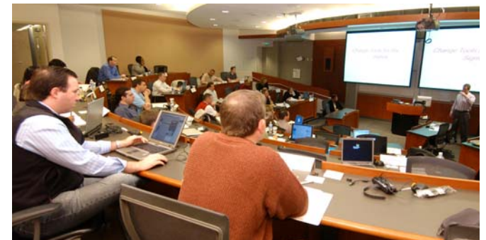
Georgia Tech's Huang Executive Education Center offers state-of-the-art executive education classrooms at the Technology Square campus in Midtown Atlanta. You can take a virtual tour at www.execinfo.org .