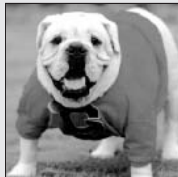
Uga the Dog Mascot

"I like to take her romping in the mud. OINK!"