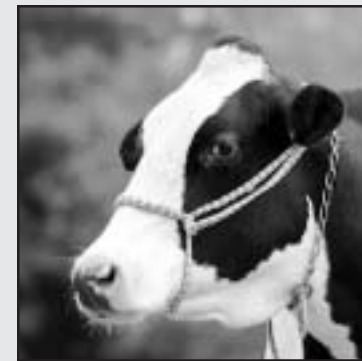
Cow CUD Senior

"Wrell, I lick 'er a wittle, then I slobber on 'er, then we go eat some chow while laying on a pile of ice."