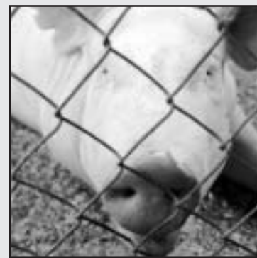
Pig COCK Freshman

What do you do with your special lady friends?