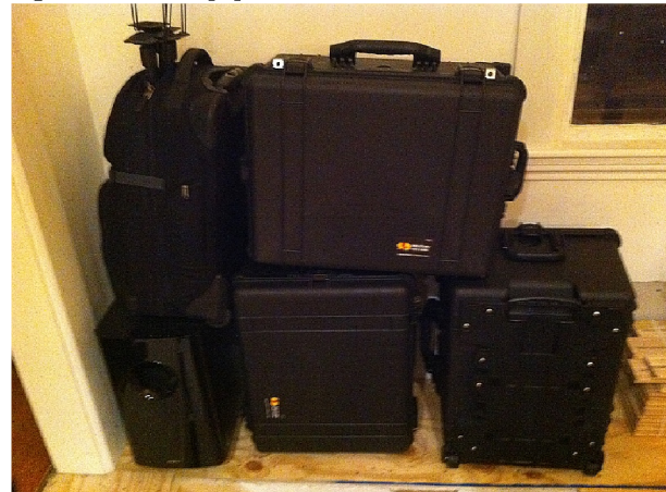
Figure 3: All the equipment needed for an Oracle show.

All of the electronic equipment for the show can be packed into the luggage shown in Figure 3. It includes a laptop computer, an Xbox 360 game controller and audio/mike headset for the puppeteer, a stereo amplifier, a mixer, two mobile microphones with their base station, 5 speakers with tripod stands, a short-throw projector, and cabling. The luggage also has room for physical props, the costume for the actress, and printed handouts. All of this is detailed in Nambiar (2011).