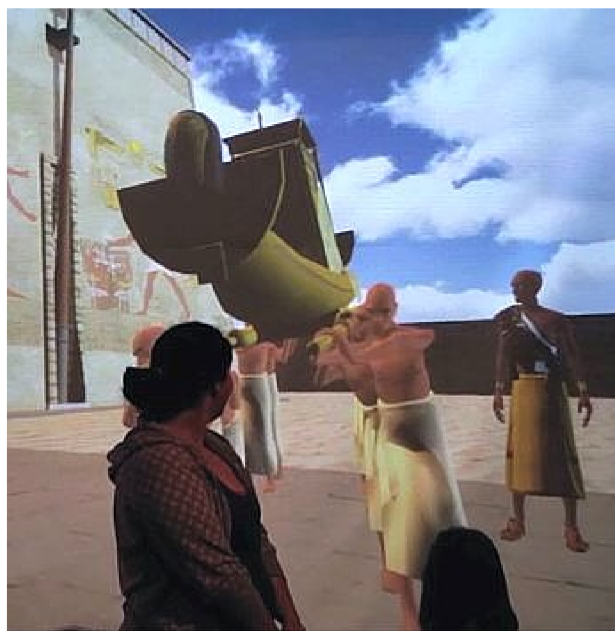
Figure 1: Live people and avatars interact.

We implemented the virtual environment and animations with the Unity game engine ( http://unity3d.com ) as an application that can run on a standard Windows® laptop. The software then introduces reverb with the aid of a 32-bit sound effects processor. It provides a wide range of effects such as echo, chorus, and double slap. The amplifier output can be increased from 80 watts through 2 channels to 130 watts through a 5-channel surround system. A powered amplifier along with a separate low-frequency line out gives us more bass control. A mixer gives a human sound-system operator more control over sound and eliminates floor noise.