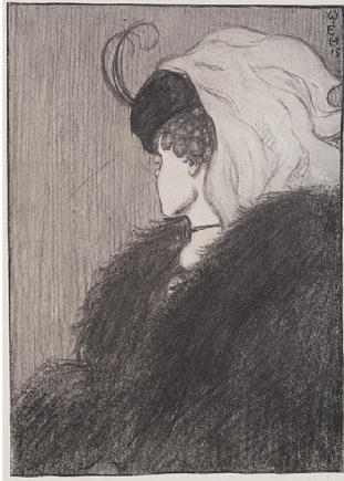
Figure 1: You can shift between seeing an old or young woman in this famous image [15]. However, it appears problematic to see both at the same time.