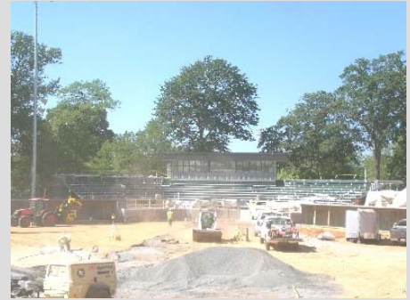
Future Site of Clough Innovative Learning Center.