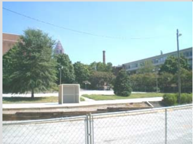
Site of the Water Reclamation Tanks at EST