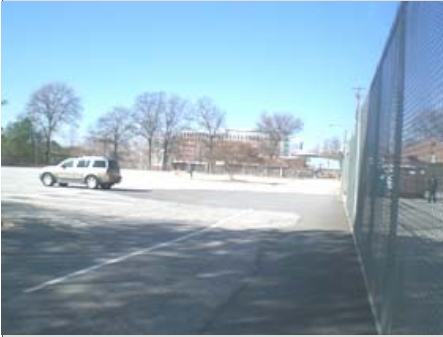
Atlantic Drive will Close Soon