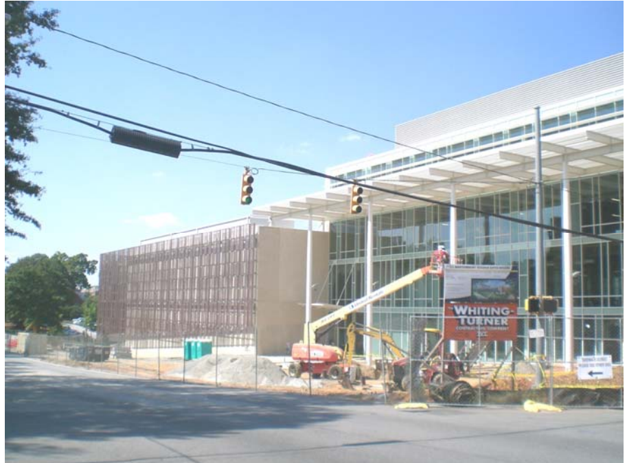
Nano Technology Center is ready to open.