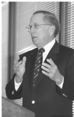
Sam Nunn, speaking about the Nuclear Threat Initiative to the Georgia Tech Advisory Board in 2002.