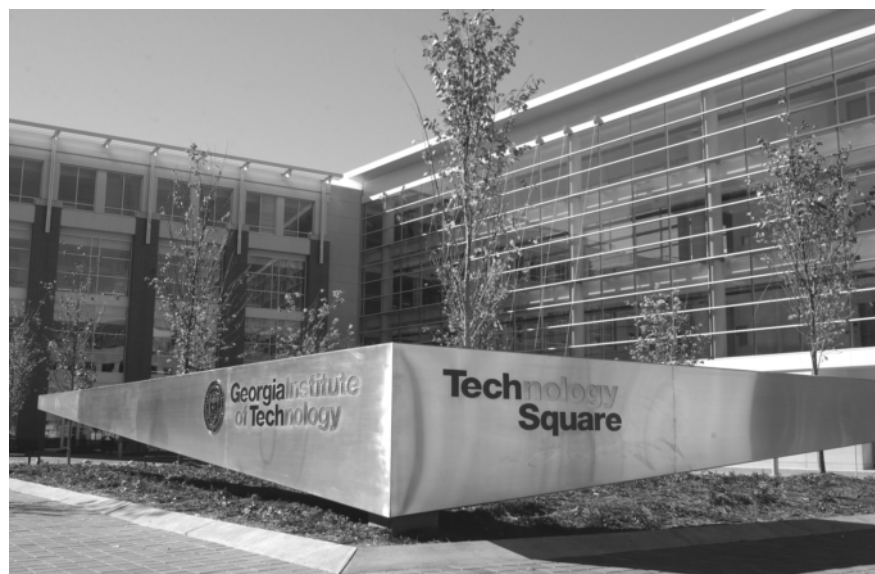
Fundraising is under way for the $45 million Management Building at Technology Square.