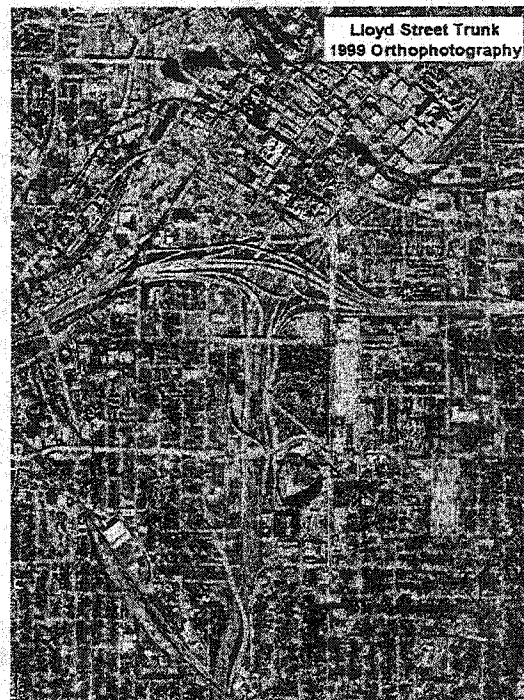
Figure 1. Digital Orthophotography in pilot area used to verify land use and assist in watershed planning.

Existing land use maps were based on digital building footprint data retrieved from the public works department. A field survey was then conducted to verify building attributes like the number of floors. To generate numbers for existing sanitary sewage flow