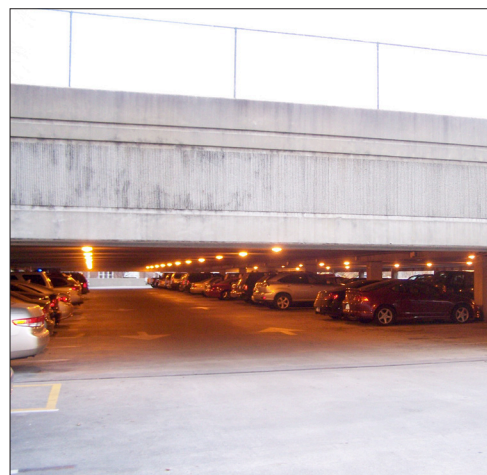
What's wrong with this picture?

Last one out? Turn off the lights, please.