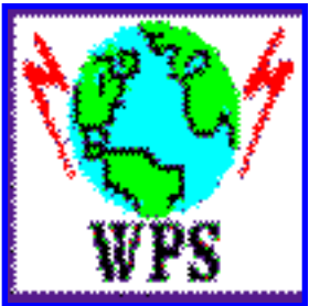
Shred Of Dignity Skater's Union

This is the hypermedia version of the film Wax Or The Discovery Of Television Among The Bees .