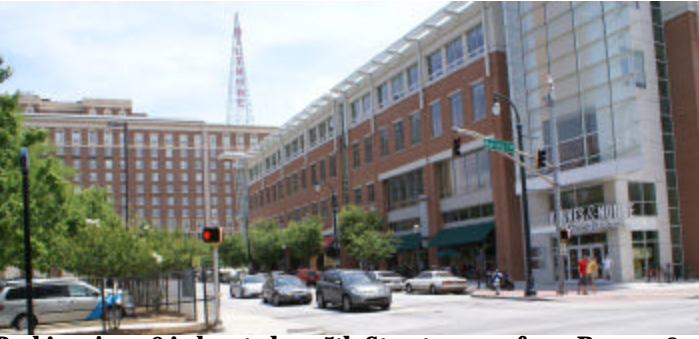
Parking Area 6 is located on 5th Street across from Barnes & Noble @ Georgia Tech. Quick and economical, this parking lot is $1 per hour and accepts BuzzCard, credit card or payments in cash. No attendant at this lot.

space and indicate that space number at the pay station. The pay station is to the immediate right upon entering the deck. The cost, $1 per hour, may be paid via credit card or cash (no pennies or dimes accepted).