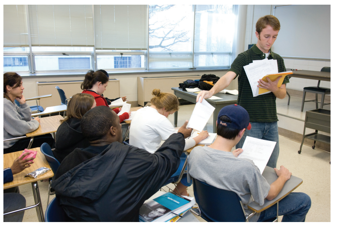
The Family Educational Rights and Privacy Act (FERPA) protects what student information can be shared, including grades.

Under the law, students have the right to: inspect and review their education records; to request an amendment to their records if they think something is inaccurate or misleading; to consent to disclosures of personally identifiable information contained in their records; and to file a complaint with the Department of Education regarding FERPA noncompliance.