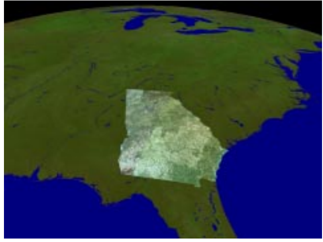
2. View approaching the state of Georgia inset data (100 m resolution).