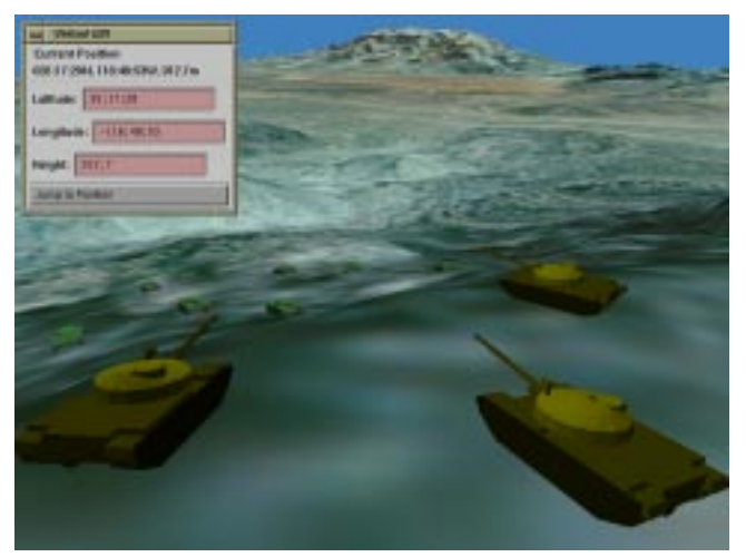
5. DIS simulation of tanks engaged in battle at Ft. Irwin, CA.