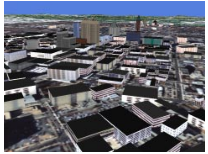
4. View of downtown Atlanta data with 3D building models.