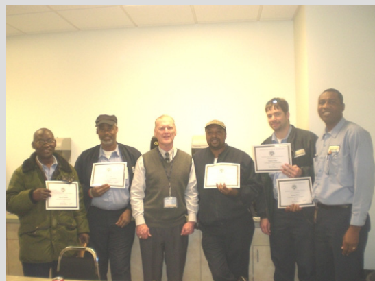
Employees from Area 2 who had perfect attendance in 2008.