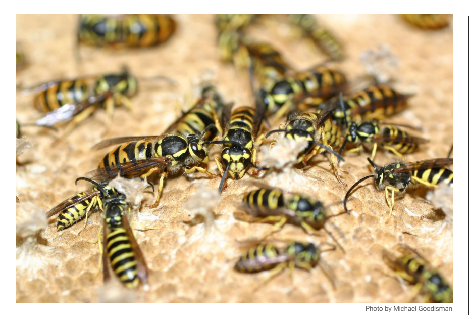
Yellow jackets exhibit extreme social behavior.