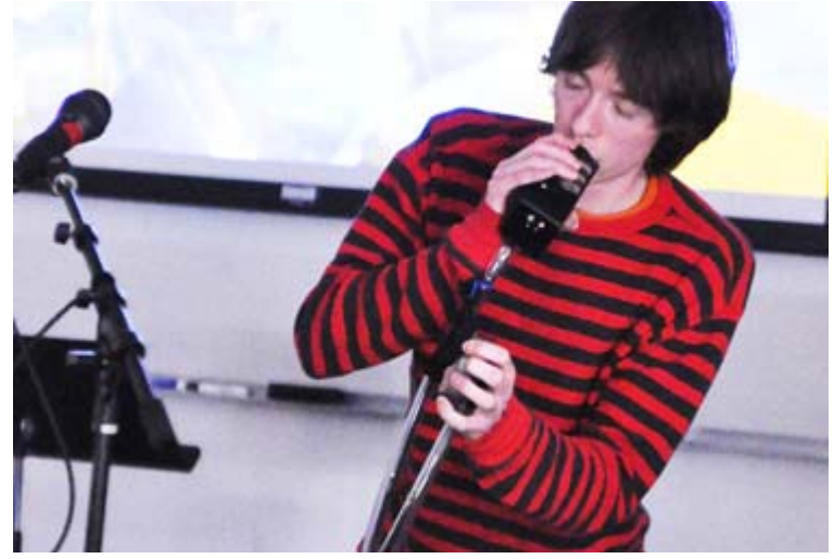
The Guthman Musical Instrument Competition this year returns with a two-day event featuring preliminary and final performances, judges panel discussion and open house showcase of new projects at the Georgia Tech Center for Music Technology.

4pm - Critique Session , summary comments by critics 5 pm - Adjournment