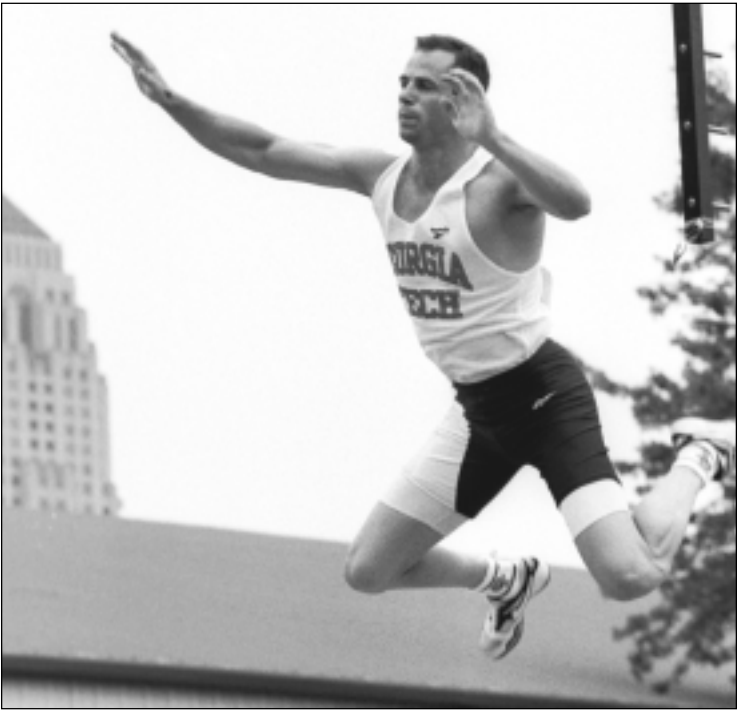
By Dale Russell / STUDENT PUBLICATIONS

The Tech men’s track team performed well at Clemson last weekend, and are looking for contributions from their standouts in this week’s action.