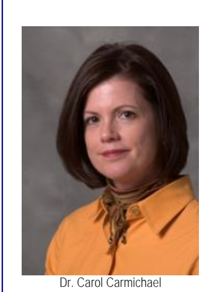
2006 ELA Recipient

where she serves as the Georgia Tech advocate for sustainability in research, education and outreach programs. She has over 20 years of experience in technology and science policy, with a particular emphasis