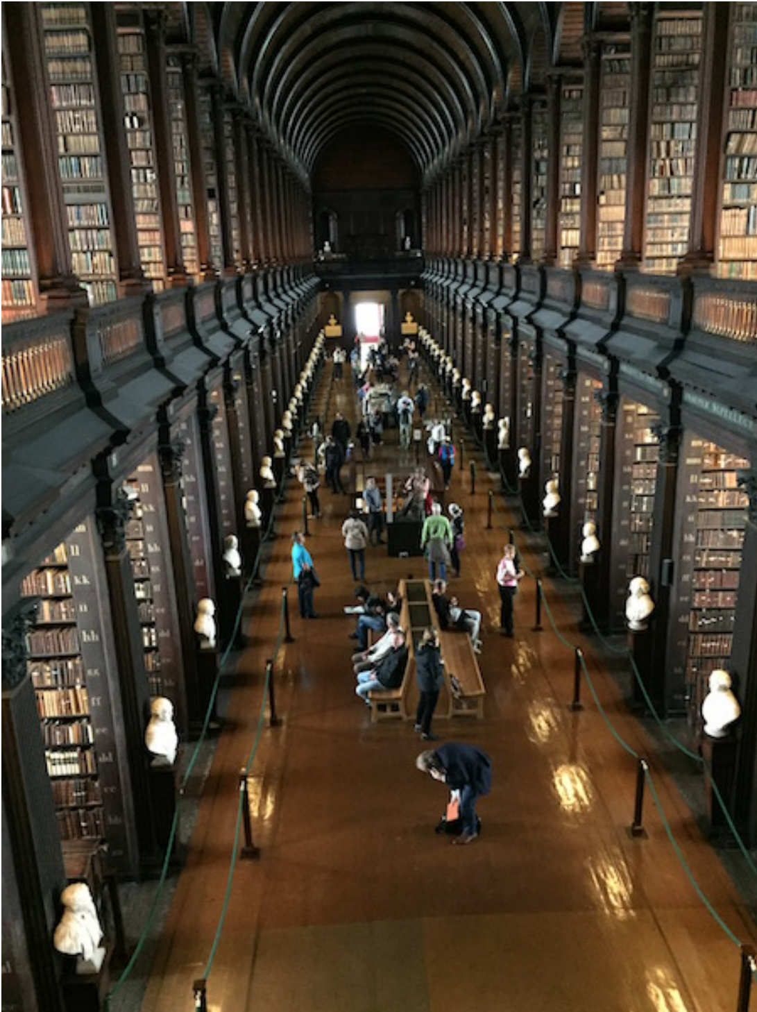
The Library of Trinity College Dublin