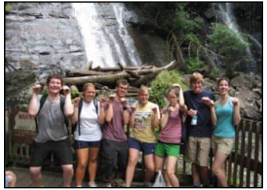
New PSs pose in front of a waterfall during their hike.