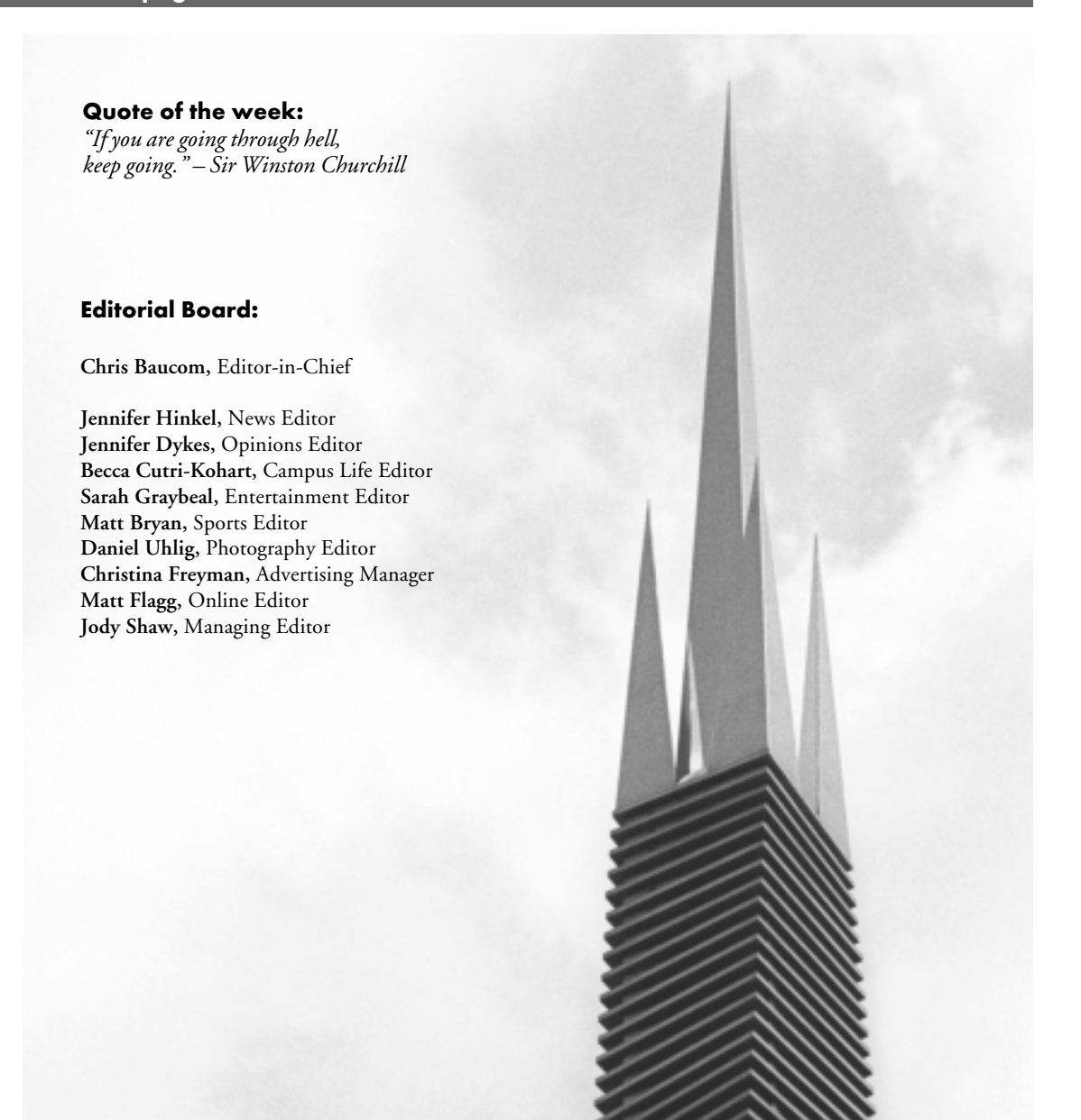
YOUR VIEWS Letters to the Editor