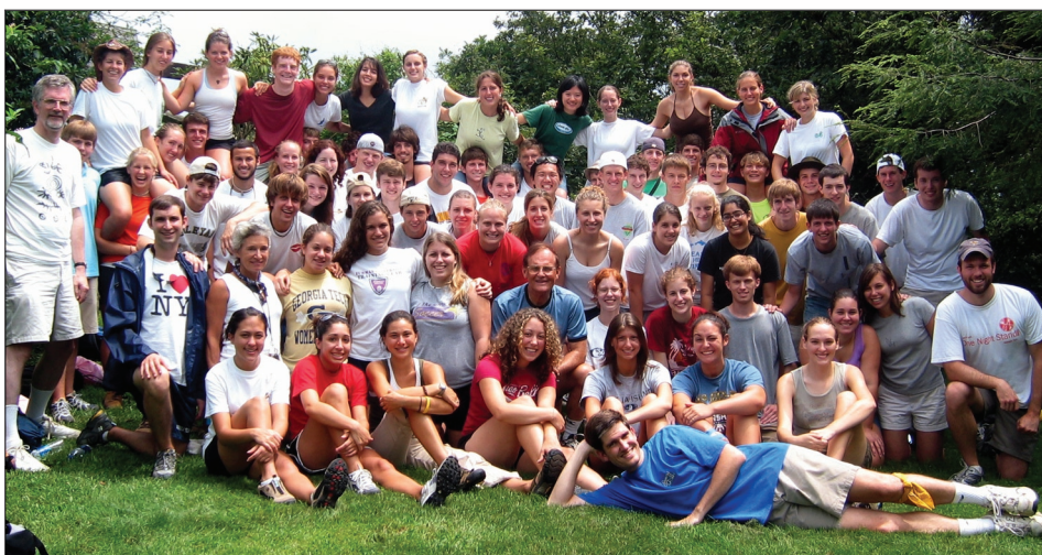
Incoming President's Scholars enjoyed this year's fall retreat at Unicoi State Park.