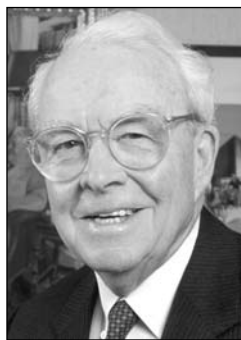
Ivan Allen Jr.

During its tenth anniversary celebration, the College honored Allen on his 90th birthday by establishing an annual Founder's Day event on his date of birth, March 15. It also instituted the Ivan Allen Jr. Prize for Progress and Service, which has since been given each year to an individual with Georgia connections who, like Allen, personifies the ideals of the College. To date, the recipients have been former Governor and now U.S. Senator Zell Miller, former Governor and President Jimmy Carter, and syndicated columnist Molly Ivins.