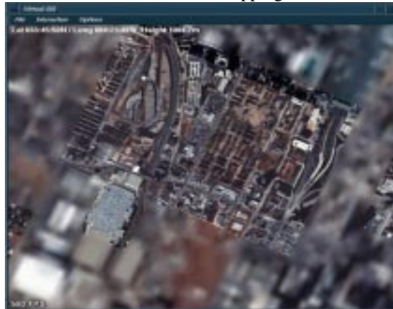
Fig 5: Same as Fig 4, with prioritized center paging