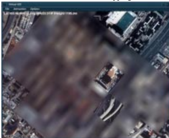
Fig 4: After fly-in, with random paging