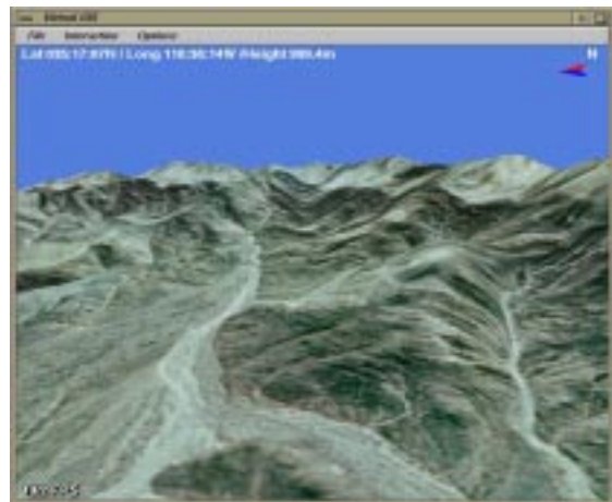
Fig 3: Same as Fig 2, with prediction & with node skipping