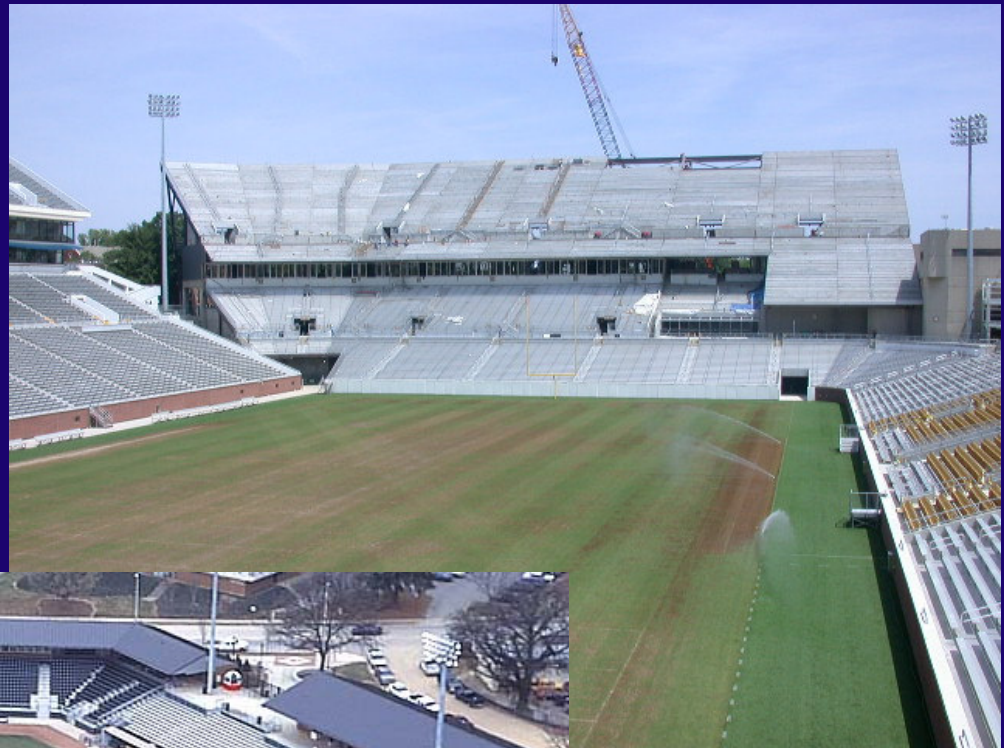
Bobby Dodd Stadium