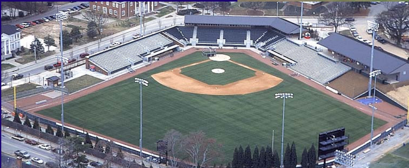
Russ Chandler Stadium