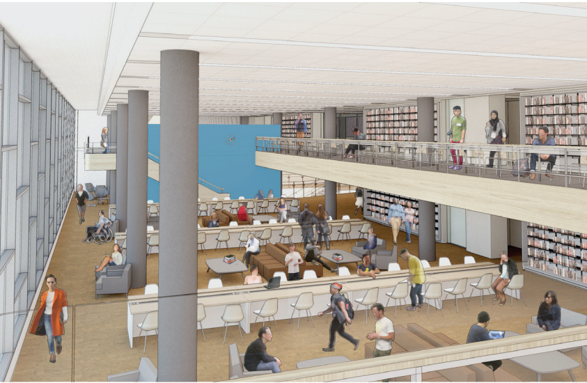
(Top) The proposed Crosland Tower seventh-floor reading room will give patrons incredible views of Midtown. (Middle) The proposed Crosland Tower third-floor atrium opens up several floors of the building to incorporate architectural elements of Price Gilbert. (Left) The first-floor Library West Commons was once home to banks of computers. When renovations are complete, the area will instead provide more flexible workspace (right) and become a reading room, harkening back to the building's original incarnation.

2BR/1BA condo for sale. 1,100 sq. ft., hardwood floors, separate living and dining rooms, street level, beautiful courtyard, reserved parking and storage. Two blocks from Lindbergh MARTA station. Call 404-307-8182 for showing.