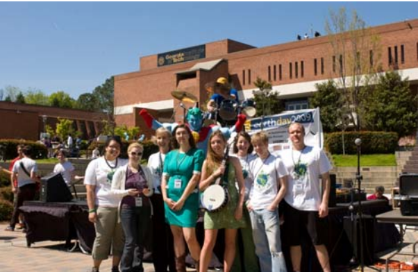
Members of SOS accept the Environmental Leadership Award at Earth Day

The ELA is awarded annually to a member of the Georgia Tech community who has exhibited environmental leadership by demonstrating a positive environmental impact and showing a commitment to restoring and enhancing the environment. The 2009 ELA recipient is Students Organizing for Sustainability (SOS), a Georgia Tech student organization. SOS works diligently to educate the campus community on a number of environmental issues, organizes relevant events on campus, and collaborates with several campus departments, including Dining Services and Housing, to help make their operations more environmentally friendly. In only two years this organization has already made a significant impact on campus, such as making it convenient for students to purchase organically grown food on campus from a local CSA (Community Supported Agriculture). We expect this organization to continue to grow and succeed in the coming years. Congratulations on your accomplishments!