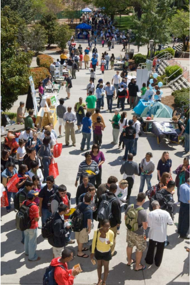
The Skiles walkway is buzzing with activity during Earth Day.