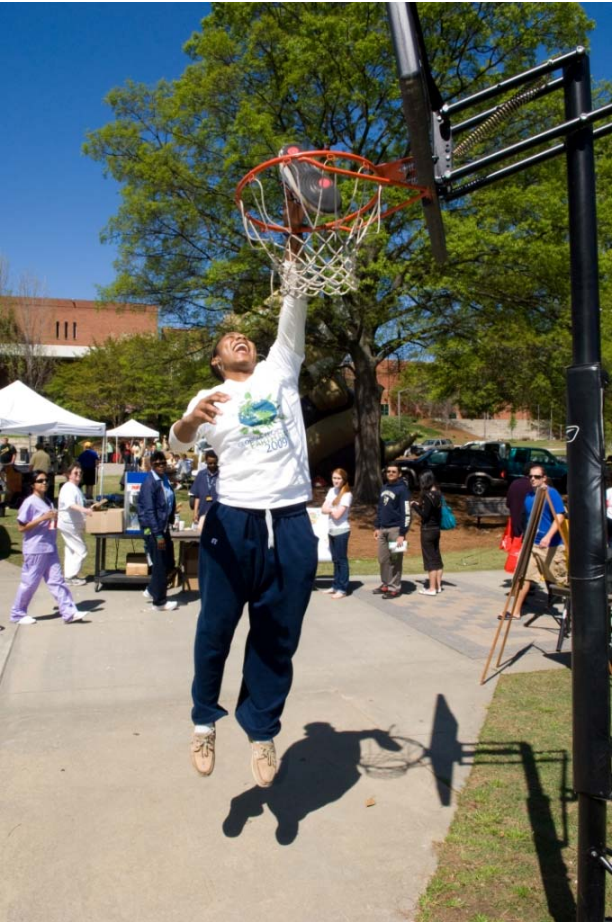
A slam-dunk at Shoot the Shoes!