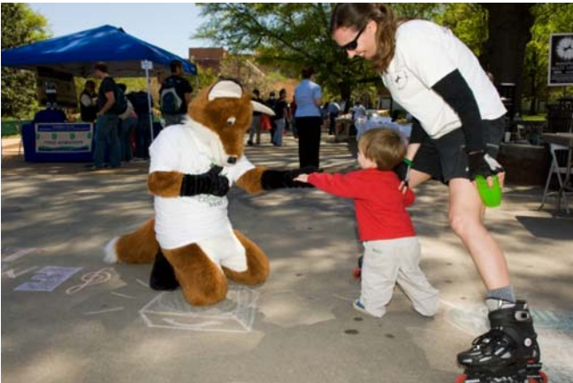
Reynard the Fox pals around with a future member of the Bohemian Skate School.