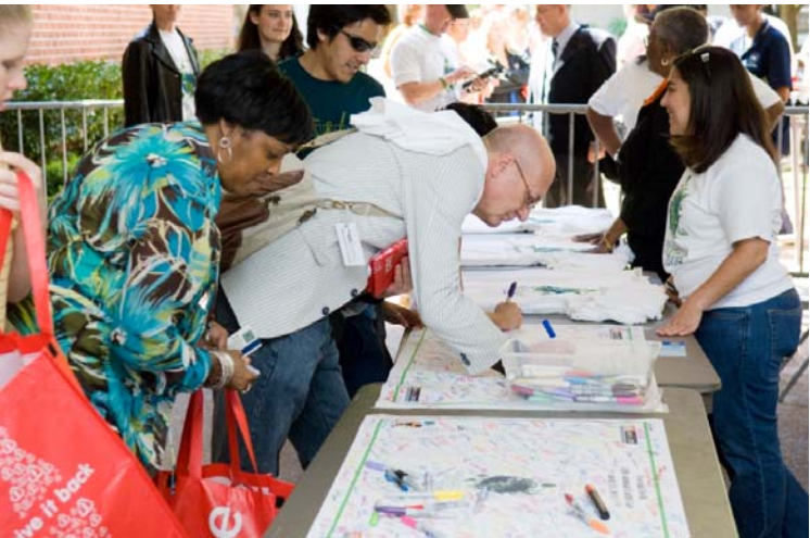
Members of the GA Tech community sign the Earth Day banner.