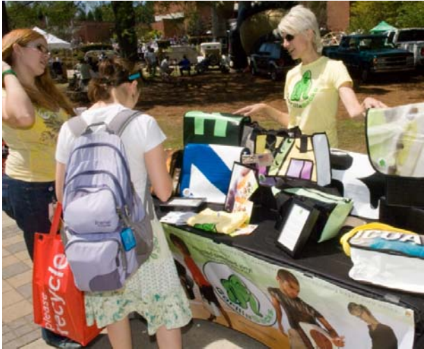
Gorilla Sacks, one of the more than 70 exhibitors at Earth Day.