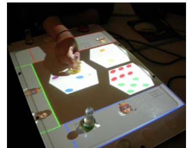
TVViews Table Role Playing Game Application

Sound interesting? Visit the SynLab website at: http://synlab.gatech.edu/ .