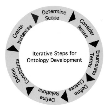
FIGURE 1. Ontology development (Noy and McGuiness 2001): The process of developing and deploying biological ontologies is a community effort that requires frequent iteration of the basic steps represented here as a cycle. The process begins by determining the scope of the ontology and proceeds next to considering how the ontology will be used. This is followed by enumeration of terms and definition of classes and relations, and the constraints that operate on these. Finally, the classes are populated with instances to create knowledge bases.