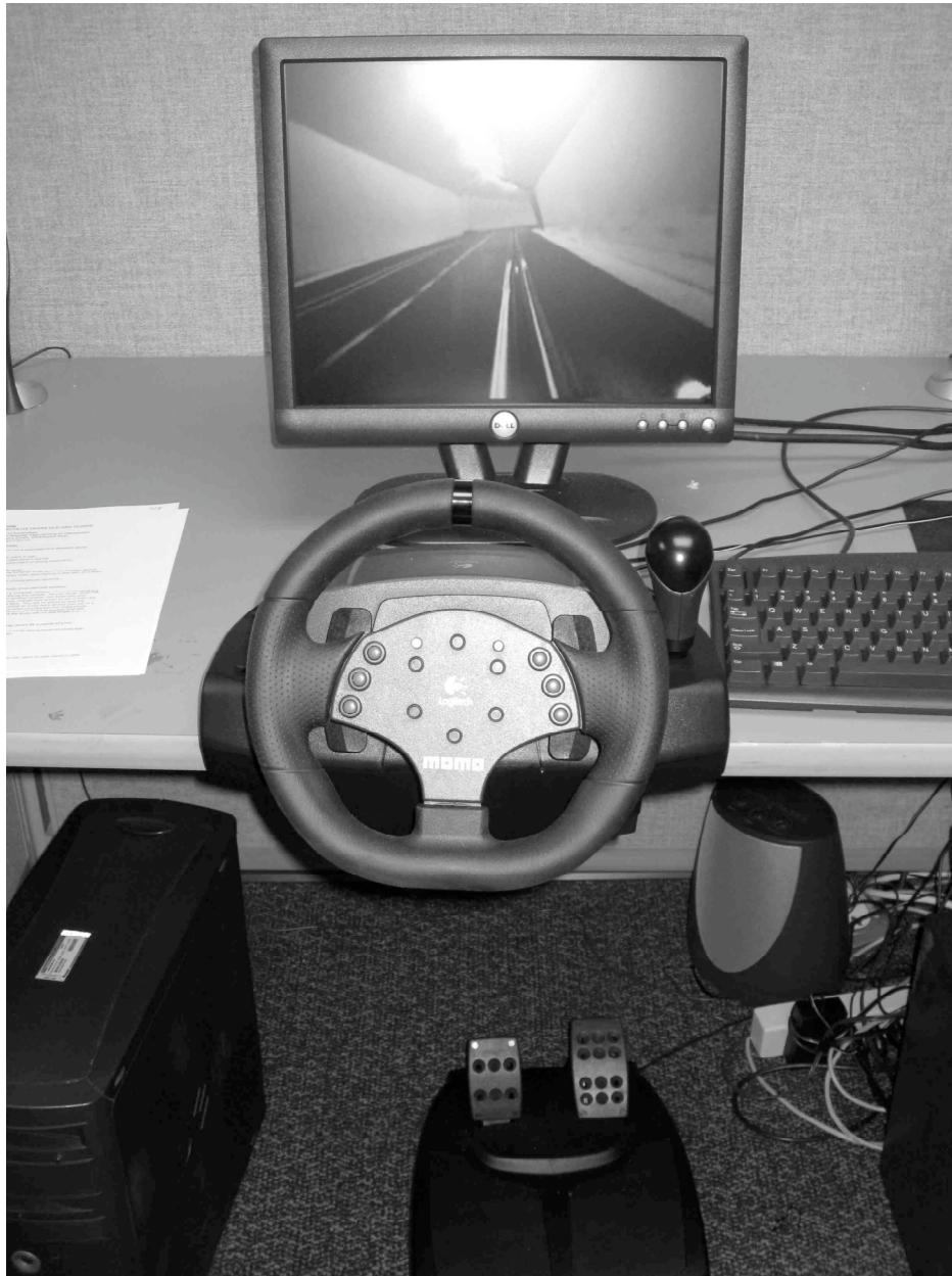
Figure 1 shows the brake pedal apparatus used in the experiment.