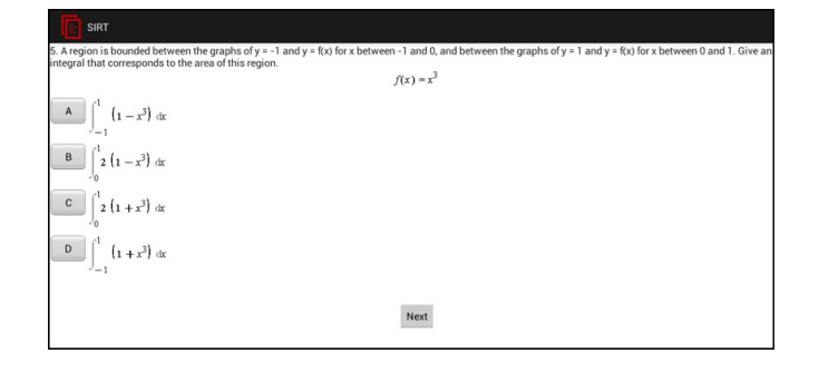
Fig. 1. The Learning Environment - Calculus Test Question Screen.

Verbal behaviors enable the educational agent to provide socially supportive phrases for reengagement as the student navigates through the test. During the utterance of verbal phrases, Darwin turns his gaze towards the student when speaking; otherwise, he remains looking at the tablet. The goal of the verbal phrases is to encourage the student based on their current performance on the test (i.e. answering a question correctly/incorrectly; speed of answer; taking too long to answer). It is very important that the phrases are socially supportive and convey the message that the subject and Darwin are taking the test together as a team. There is a dialogue established between the subject and Darwin, and not a unidirectional knowledge flow (i.e. Darwin is not giving instructions or issuing commands to the subject). This open dialogue integrating socially supportive phrases between