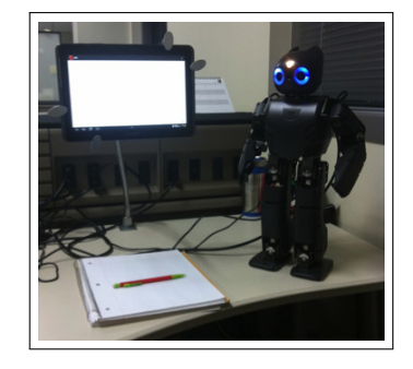
Fig. 2. The Robotic Educational Agent Darwin.

For the robotic educational agent, we utilized the DARwIn-OP platform (Darwin) [20], a humanoid robot with 20 actuators, resulting in 6 DOF for each leg, 3 DOF of freedom for each arm, and 2 DOF for the neck (Fig. 2). To enable