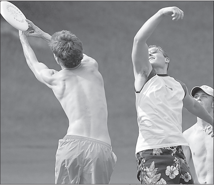
By Jamie Howell / STUDENT PUBLICATIONS

Ultimate is one of the most popular pastimes on college campuses, in part because it requires only a disc and an open field to play.