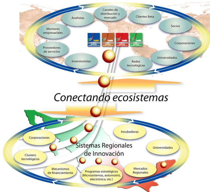
Figure 2 - “Connecting Ecosystems”