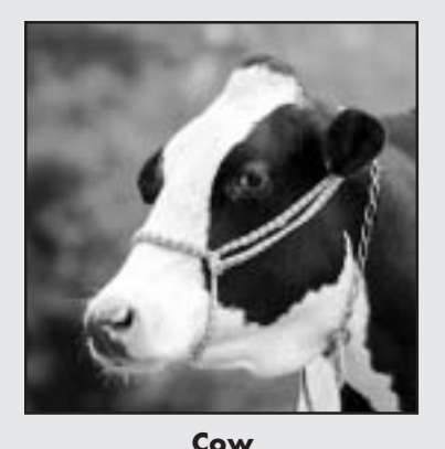
CUD Senior "We like to eat each other's ruminated food."