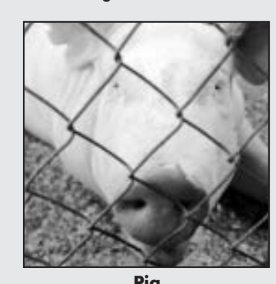
Pig COCK Freshman "I like to take her romping in the mud. OINK!"