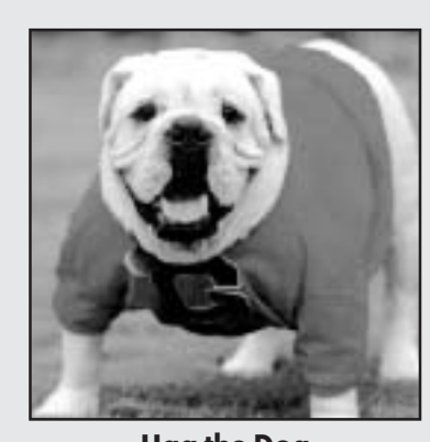
Uga the Dog Mascot "Wrell, I lick 'er a wittle, then I slobber on 'er; then we go eat some chow while laying on a pile of ice."