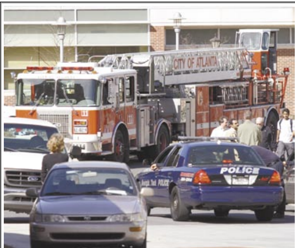
By Ethan Trewitt / STUDENT PUBLICATIONS

Something's burning: The Klaus Advanced Computer Science Building was evacuated Wednesday afternoon after a jacket was left on a radiator and caught on fire in a lab.