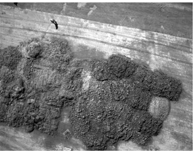
Black and white photograph taken from a prototype reconnaissance round shows a person standing in a sod farm near Atlanta.

Stancil emphasizes the system's simplicity, as well as