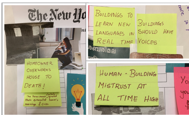
Figure 2: Excerpts of the Group 1 design fiction task

This group's design fiction centred around the idea of buildings as "living beings". They imagined a future in which houses were sentient and had feelings. The issue from the past was therefore described as a decision by designers to not give buildings natural language processing abilities, which led to their inability to properly communicate their stresses. In terms of future developments, they described new modern houses that will allow for better communication, possibly linking to sustainability as the inhabitants can be told if their resource use is too high.